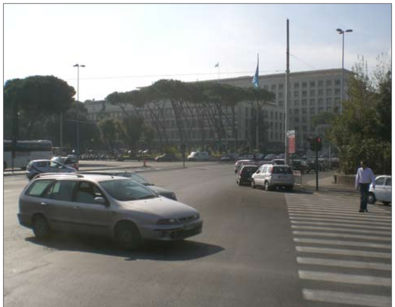
Picture 1. FAO Headquarters in Rome, Italy.

Contributions from Virginia Tech focused on the current state and the outlook for the North American forest product industries and on activities of department faculty and students