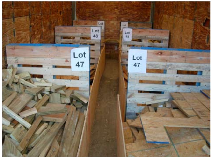
Figure 3. Inside view of storage trailer used to collect waste wood materials from a building site in Blacksburg, VA.

Buehlmann, Araman and Hindman also presented information about their effort in the area of green building programs in the U.S. Their current research focuses on the recyclability of building waste and a current study being conducted by Kevin Knight, one of their students, who is investigating the merits of the different green building programs in use in the United States. Figure 3 shows a picture