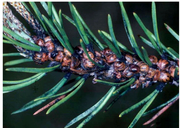
Pine tortoise scale.