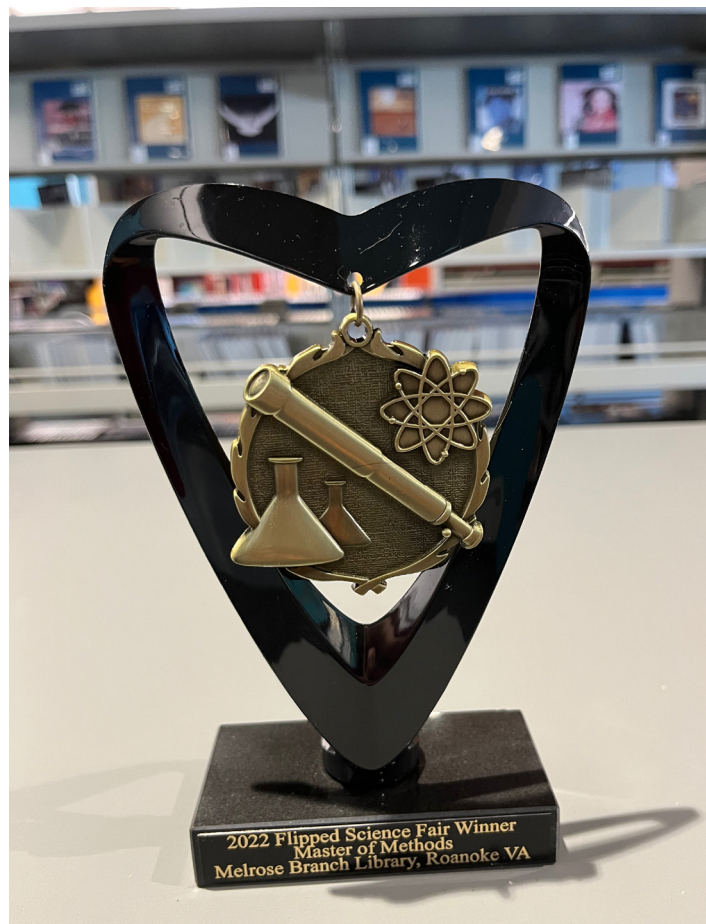
Figure 8. Five trophies were awarded to top-ranked presenters: Curious Questioner, Master of Methods, Radical Results, Prettiest Poster, and Top Presenter. These trophies were purchased and provided by the Roanoke Public Libraries (RPL).

In addition to these videos, we have documented the Flipped Science Fair through local news and academic