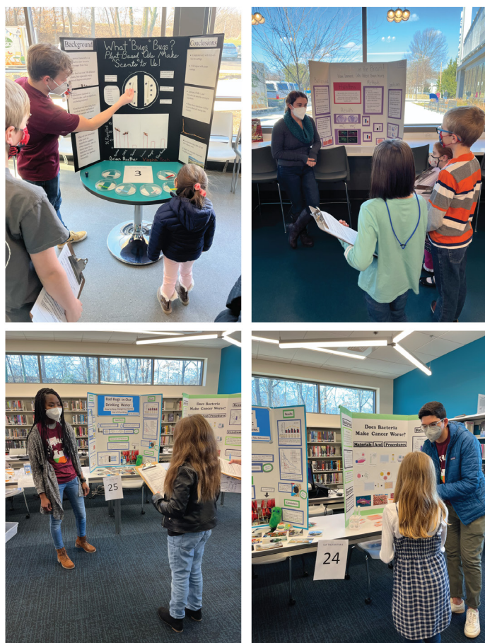
Figure 1. Graduate students created tri-fold posters and presented their work to child judges.

lication of the event, especially by graduate student teams, below we describe in detail our planning process, the recruitment and training of graduate presenters, logistics for the day of the Flip the Fair event, and the documentation and promotion of the event’s success.