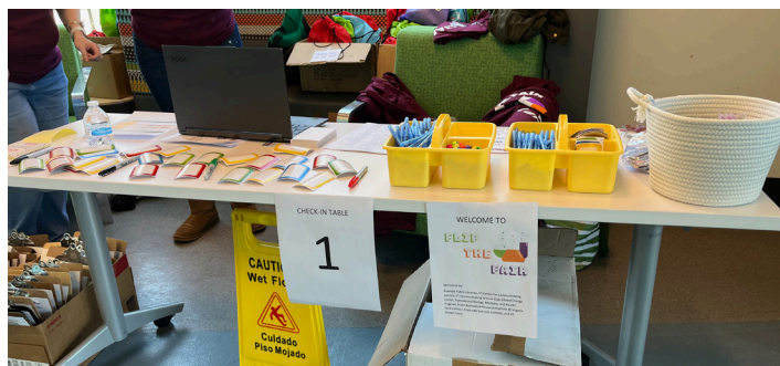
Figure 6. All participants were greeted at a check-in table, where they received goodie bags, raffle tickets, clipboards with judging forms, and name tags.

Set-Up Logistics. Setting up the Flip the Fair event took sev-