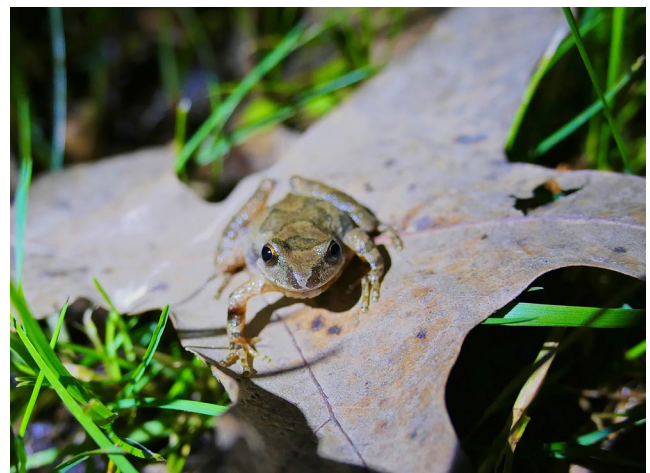
FIGURE 1 A male Pseudacris brachyphona during advertisement calling activity in a small, isolated wetland in southwest Virginia, USA

Training modules consisted of presentations by the coauthors on regional anuran diversity, characteristics of Mountain Chorus Frogs, the purposes of the monitoring effort, and how to identify