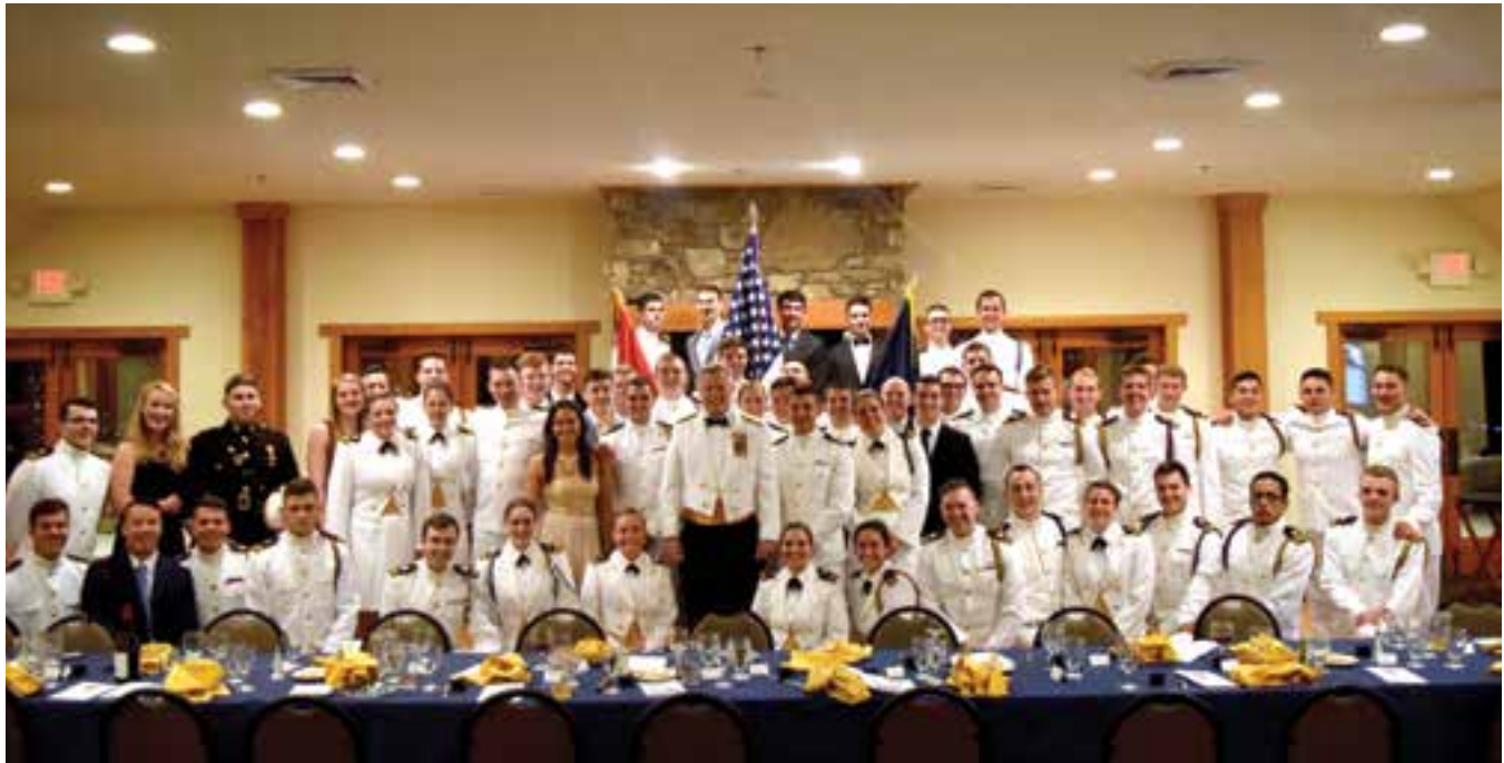
Midshipmen, unit officers, and local veterans attended the annual Senior Dining-In on April 21.