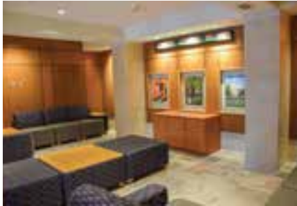
The lobby of New Cadet Hall.