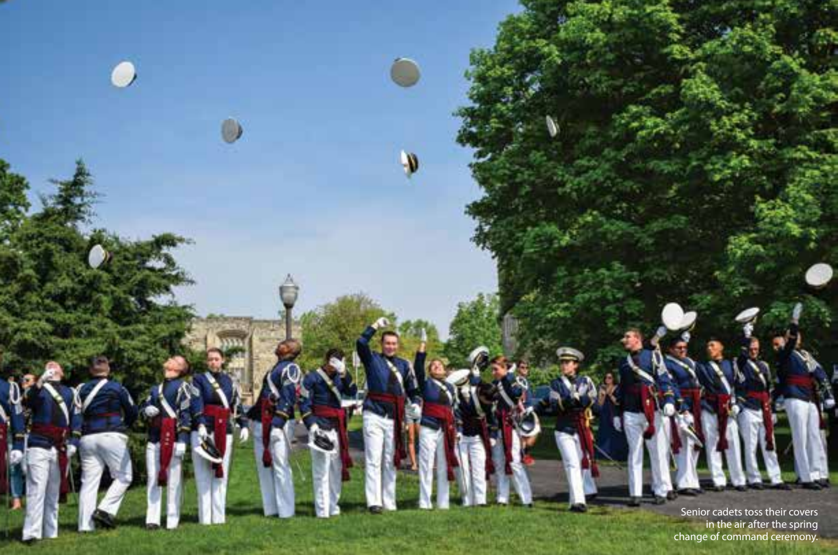
Senior cadets toss their covers in the air after the spring change of command ceremony.