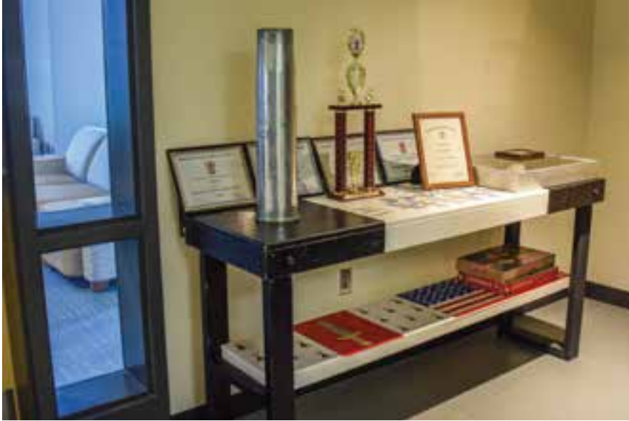
Lima Company offers a display of company memorabilia outside the fifth-floor study lounge of New Cadet Hall.