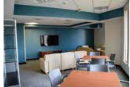
One of the study lounges in New Cadet Hall.

and a maroon-brick sidewalk that forms the largest “VT” on campus to connect Lane, Pearson, and New Cadet halls.