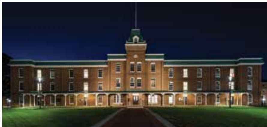
New lighting bathes Lane Hall each night.

Band camp will be conducted during that same time. The Highty-Tighties are coming off a strong year of performances, including the Battle at Bristol in Tennessee and the Cherry Blossom Festival Parade in Washington, D.C. They wrapped up the year with a tremendous concert in the Moss Arts Center, along with the Southern Colonels jazz band and the Pipe and Drum Team. They have