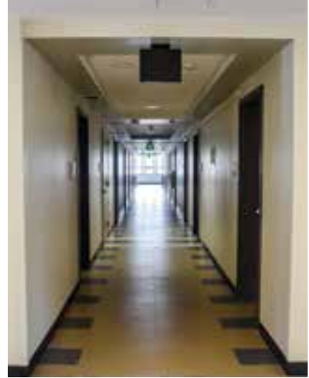
As in Pearson Hall, the floor tiles in New Cadet Hall are spaced the exact width of the desired stride length for cadets, helping them develop their marching skills.

Hundreds of cadets will move into New Cadet Hall, the second of two new residence halls for the Virginia Tech Corps of Cadets, in August.