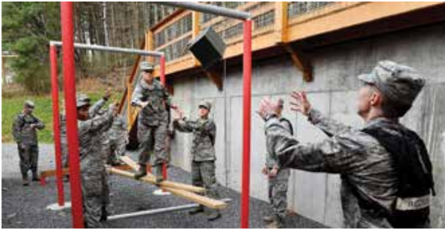
Air Force cadets participated in Leadership, Evaluation, and Development training at Virginia Military Institute with other Virginia ROTC units. The first half of the day consisted of group leadership problems, the Leadership Reaction Course, obstacle course challenges, and even an introduction to weapon safety.