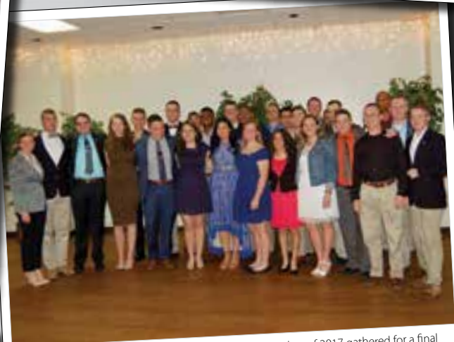
On May 4, the Highty-Tighties' newest alumni from the class of 2017 gathered for a final time before graduation at the annual Highty-Tighty Banquet.