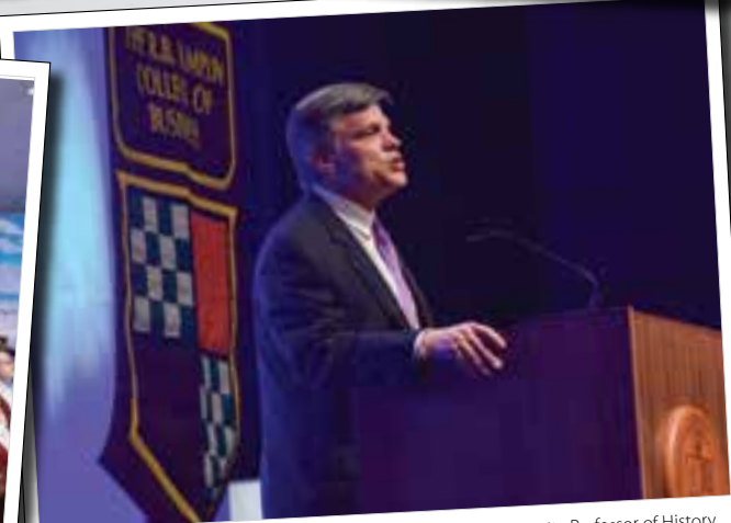
Best-selling author, presidential historian for CNN, and Rice University Professor of History Douglas Brinkley gave the Cutchins Distinguished Lecture on April 6.