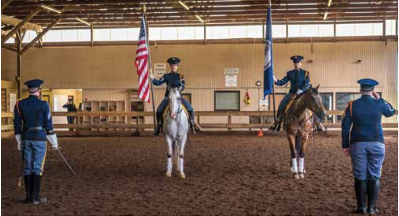
Members of Conrad Cavalry present the colors at their end-of-year event. See more pictures at vtcc.vt.edu/corpsreview .