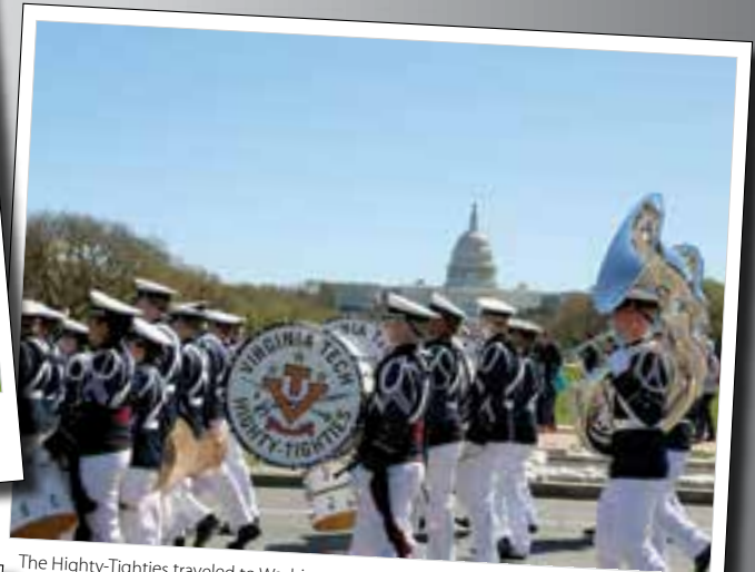
The Highty-Tighties traveled to Washington, D.C., to march in the Cherry Blossom Festival Parade on April 7.