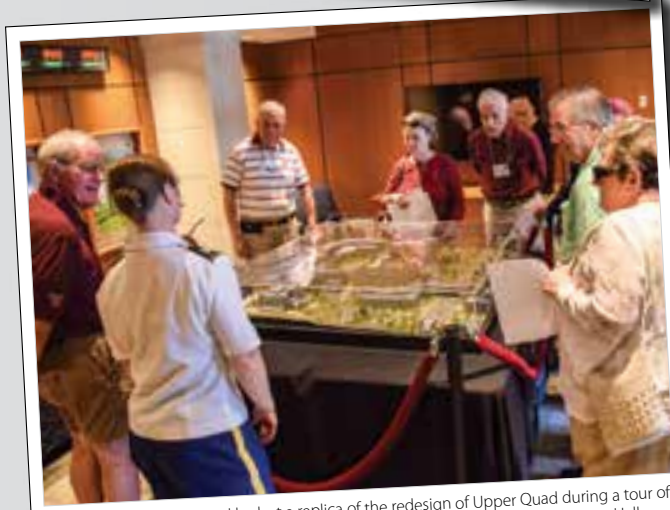
Members of the Old Guard look at a replica of the redesign of Upper Quad during a tour of Upper Quad during their reunion on May 18. The model is in the lobby of Pearson Hall.