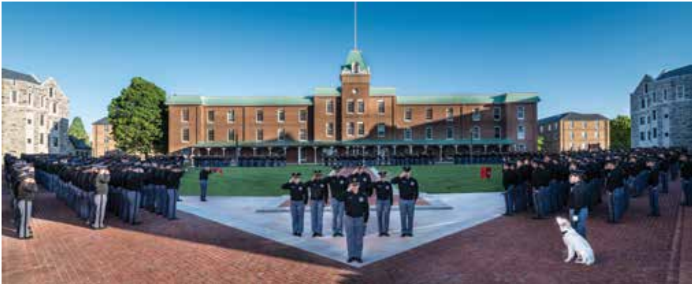
The regiment conducted its final formation of the spring semester on the new “VT” sidewalk in front of Lane Hall. The last time this happened, the senior cadets were first-year students.

some exciting plans for next year, so stay tuned for future announcements!