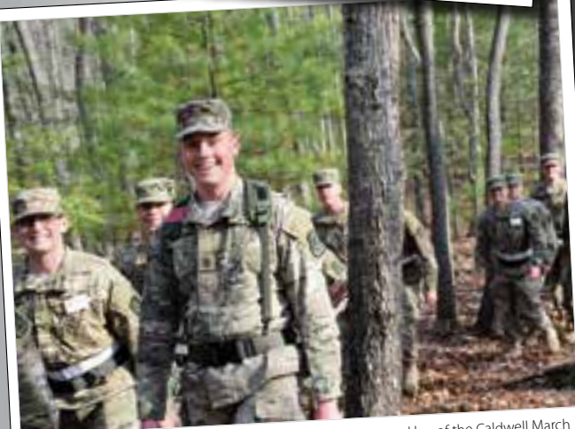
First-year cadets and their training cadre completed the second leg of the Caldwell March on April 15.