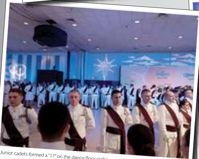
Junior cadets formed a "17" on the dance floor at this year's Ring Dance on March 24.