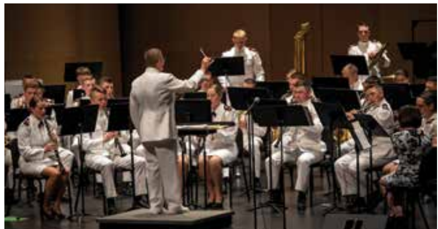
The Highty-Tighties, the Southern Colonels jazz band, and the Pipe and Drum Team ended the semester with a performance in the Moss Arts Center.

Thanks for reading. And thanks for your essential support to your Corps!