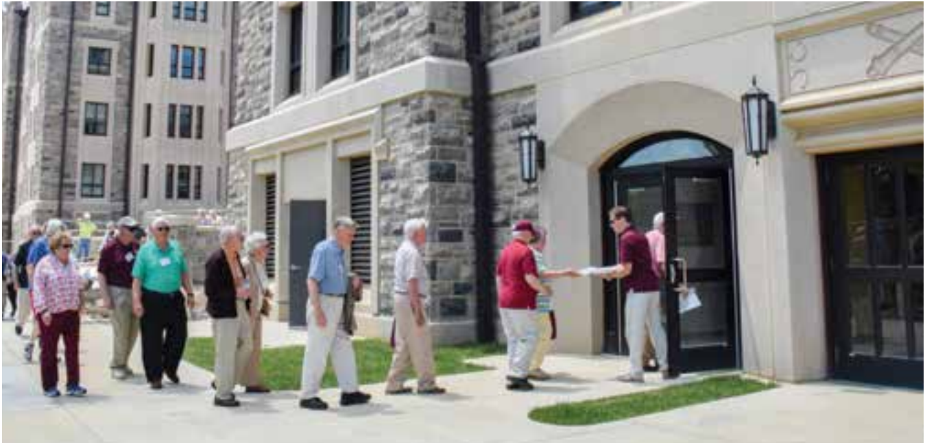
Members of the Old Guard took a tour of Pearson Hall during their May 18 gathering on campus.

investing in Virginia Tech and the Corps in the minds of cadets, to pay it forward as alumni have done before them. Being able to facilitate these connections and foster the development of the Corps, truly makes me feel like I am an integral part of the organization. I always look forward to another breakfast each fall!