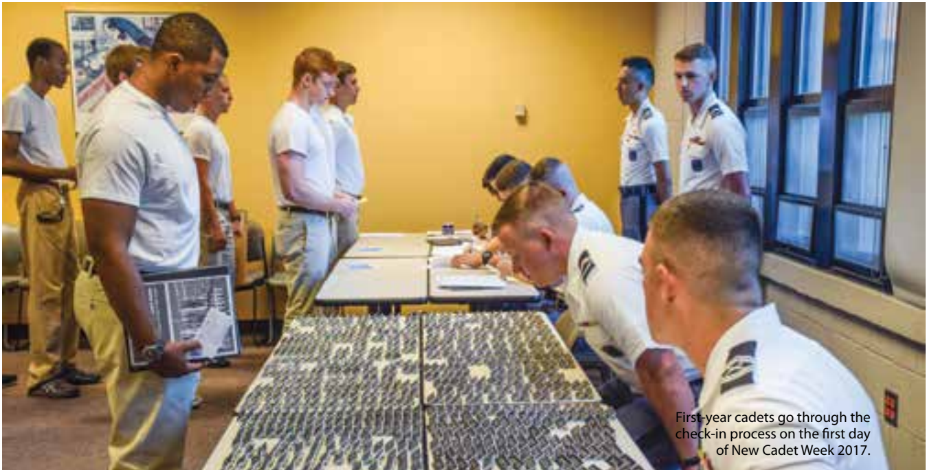
First-year cadets go through the check-in process on the first day of New Cadet Week 2017.