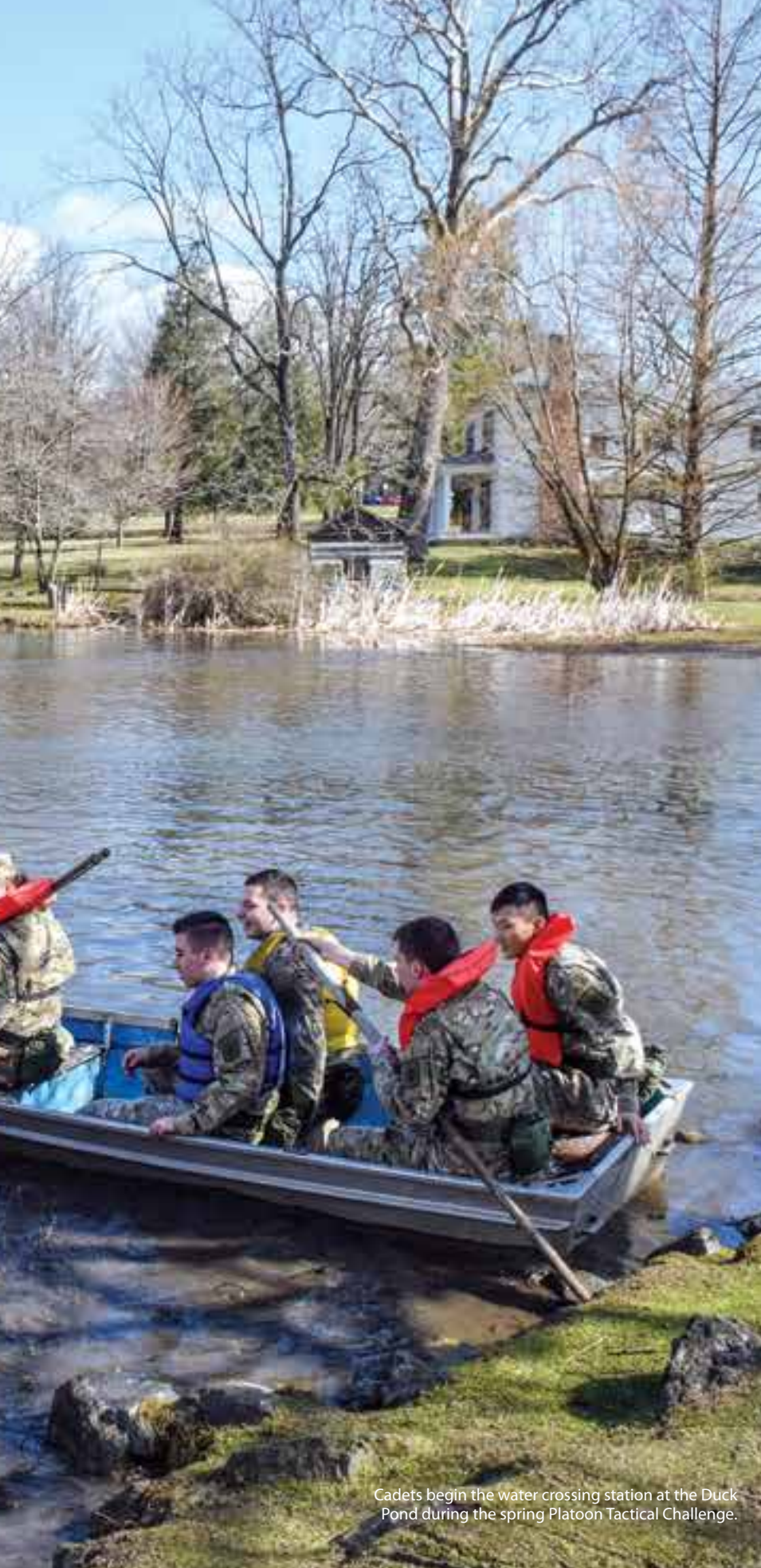
Cadets begin the water crossing station at the Duck Pond during the spring Platoon Tactical Challenge.