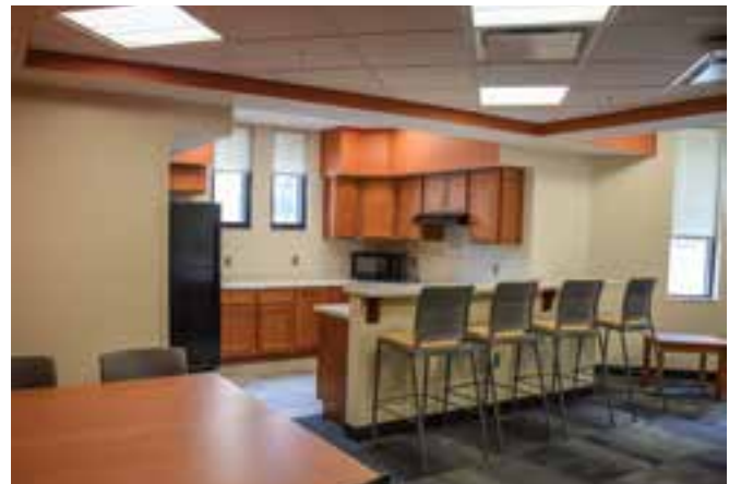
The basement level of New Cadet Hall contains a gym for cadets and a full kitchen. See more pictures online at vtcc.vt.edu/corpsreview .