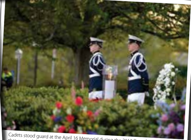
Cadets stood guard at the April 16 Memorial during the 2017 Day of Remembrance that marked the 10-year anniversary of the tragedy.