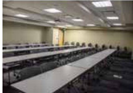
The New Cadet Hall company meeting room.