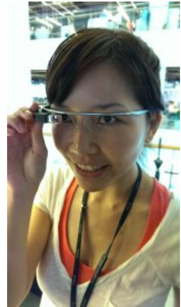
Figure 15.7: Google Glasses

During the introductory stage, the industry as whole will sell only a relatively small quantity of the product, so competitors will distribute the product through just a few channels. Most retailers charge what is called a “slotting fee”—a payment the manufacturer makes to persuade the retailer to stock the item. If the product fails, they do not offer refunds on these charges, so producers will want to be confident that a product will draw enough customers before they pay these fees and so may limit its initial distribution. Because sales at this stage are low while advertising and other costs are high, all competitors tend to lose money during this stage.