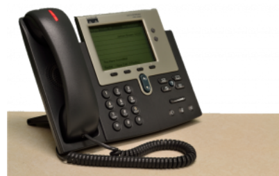
Figure 15.10: A Landline Phone. While Many Households Have Switched to Using Cell Phones, Landlines Are Still Used in Office Settings.

At some point, virtually every product will reach the decline stage , the point at which sales drop significantly. New innovations, changes in consumer tastes, regulations, and other forces from the macro-level business environment can change the outlook for a product almost overnight. Products with a very short life cycle are known as “fads.” They may move through the entire product life cycle in a matter of months. Many products, particularly those which have experienced a long period in maturity, may stay in the decline phase for years. Ironically, price levels during the decline stage may actually increase, which occurs because the number of competitors is few—in fact, there may be only one remaining, giving that company great pricing power over the few consumers who still want or need the product. New product development is usually very limited, unless a company believes that innovation can restart growth in