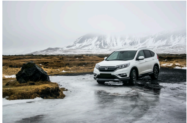
Figure 15.3: Honda, a Top Automotive Manufacturer

Sport utility vehicles (SUVs) are among the most popular categories of passenger car on US roads. Offering an elevated view of the road, the safety that comes with size, spacious interior and cargo areas, and often superior handling performance in bad weather—especially 4-wheel-drive SUVs—it is no wonder that American consumers have bought tens of millions of these vehicles. For a long time, SUV sales followed close to the classical pattern of what is known as the product life cycle: