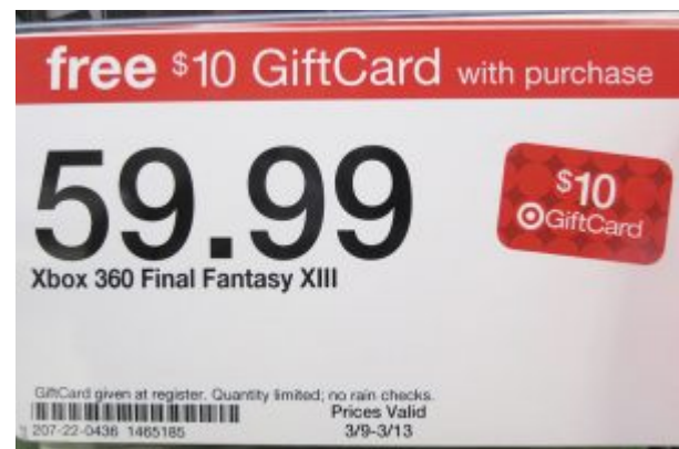
Figure 15.2: Odd-Even Pricing—It’s Less Than $60.00!

Do you think $9.99 sounds cheaper than $10? If you do, you’re part of the reason that companies sometimes use odd-even pricing —pricing products a few cents (or dollars) under an even number. Retailers, for example, might price Robosapien at $99 (or even $99.99) if they thought consumers would perceive it as less than $100.