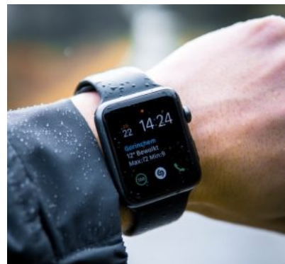
Figure 15.8: Apple watch

If a product survives the growth stage, it will probably remain in the maturity stage for a long time. Sales still grow in the initial part of this stage, though at a decreasing rate. Later in the maturity stage, sales will plateau and eventually begin to move in a slightly downward direction. By this stage, if not sooner, competitors will have settled on a strategy intended to deliver them a sustainable competitive advantage—either by being the low cost producer of a product, or by successfully differentiating their product from the competition. Since at least one competitor will generally move towards a low-cost strategy, after initially peaking, price levels begin to decline during the maturity stage. Price wars may even occur, but profits still tend to be strong because sales volume remains high.