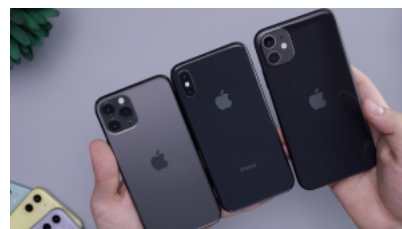
Figure 15.9: iPhones

As the product becomes outdated, the company may make changes in keeping with changing consumer preferences, but usually not as rapidly as in the earlier stages of the life of a product. Branding becomes a key aspect of success in the maturity stage, particularly for those companies seeking to differentiate their products as their source of competitive advantage. Also during the maturity stage, industry consolidation is high; in other words, larger competitors will buy up smaller competitors in order to find synergies and build share and scale economies. Some models of the product life cycle reflect a stage called “ shakeout ,” which occurs towards the end of the growth and the beginning of the maturity stages. The term shakeout reflects this trend towards industry consolidation. Some competitors survive and others get “shaken out,” either by going out of business or by being acquired by a stronger competitor.